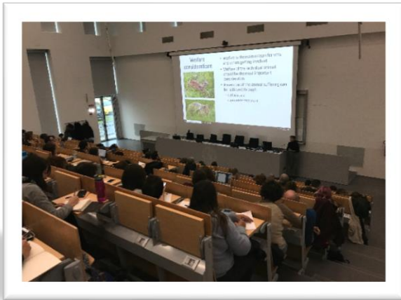
The seminar was held in the lecture hall of the Faculty of Veterinary Medicine of the University of Milan