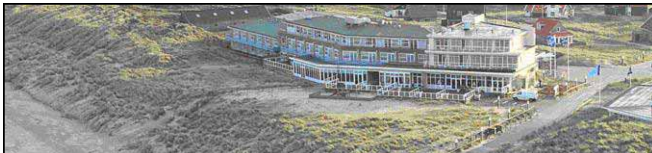
Hotel Seeduyn, the conference centre

The main theme of the conference is “Healthy wildlife, healthy people.” 75% of human emerging infectious diseases arise from animals, and mainly wild animals. To address this theme, we are inviting various medical researchers and public health specialists to this wildlife disease meeting to directly explore the interface between wildlife and public health. This meeting will be of interest for people from a variety of disciplines, including public health professionals, wildlife disease specialists, ecologists, biologists and epidemiologists. Besides science, there also will be the opportunity to enjoy the island on the free afternoon and post-conference activities. These include bird watching, a trip by truck to the sandbanks, horseback riding, horse cart riding, and sailing on a traditional Dutch barge.