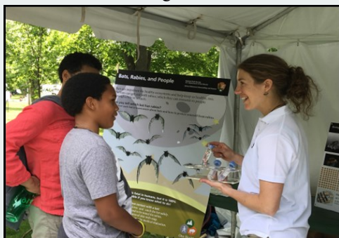
Policy, education, and outreach

Who: Eligible students will be in their 4 th year of veterinary training during the time of the externship. Six to eight students will be accepted each year.