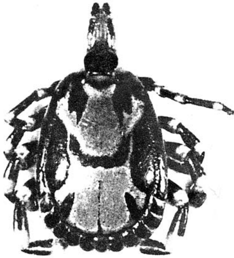
FIGURE 4. Photograph of Tick A.